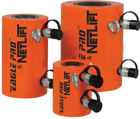
Soldan sağa doğru modeller / Shown from left to right EDX-1006, EDX-1002, EDX-2006